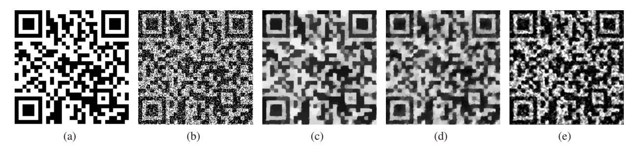
Figure 2. Example of barcode denoising for the isotropic and anisotropic models on a 175 \times 175 image. a) Clean image. b) Noisy image. c) Anisotropic denoising. d) Isotropic denoising. e) Median filter.

of the original image. The penalty parameter \lambda for each model was chosen so as to maximize the on the 300 \times 300 image. As expected, the anisotropic TV regularizer is more appropriate for the underlying structure of the image, and thus obtains lower reconstruction errors. An example is shown in Figure 2, where we also observe visually better reconstructions via the anisotropic model. Additional experimental results are in (Barbero & Sra, 2011).