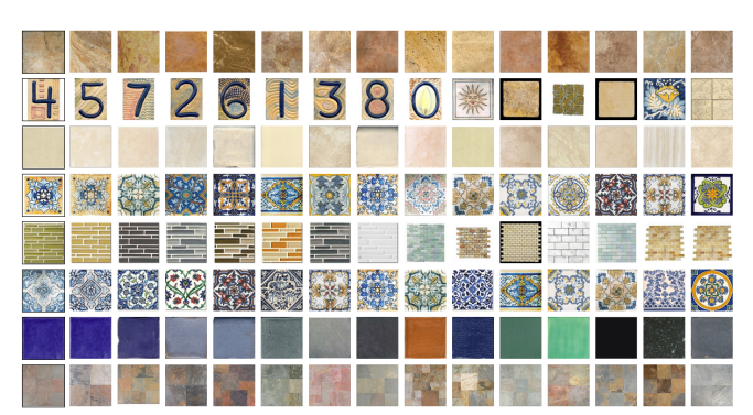
Figure 5. Examples of nearest neighbors for floor tiles.