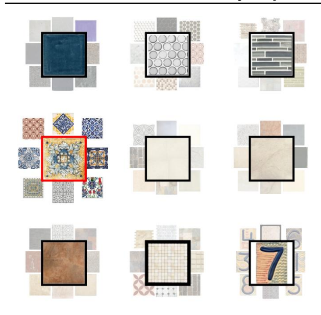
Figure 1. A sample top-level of a similarity search system that enables a user to search for objects by similarity. In this case, since the user clicked on the middle-left tile, she will "zoom-in" and be presented with similar tiles.

a more similar to b or to c," has a number of desirable properties over the classical approach employed in Multi-Dimensional Scaling (MDS), i.e., asking for a numerical estimate of "how similar is object a to b." These advantages include reducing fatigue on human subjects and alleviating the need to reconcile individuals' scales of similarity. The obvious drawback with the triplet based method, however, is the potential O(n^3) complexity. It is therefore expedient to seek methods of obtaining high quality approximations of K from as small a subset of human measurements as possible. Accordingly, the primary contribution of this paper is an efficient method for estimating K via an information theoretic adaptive sampling approach.