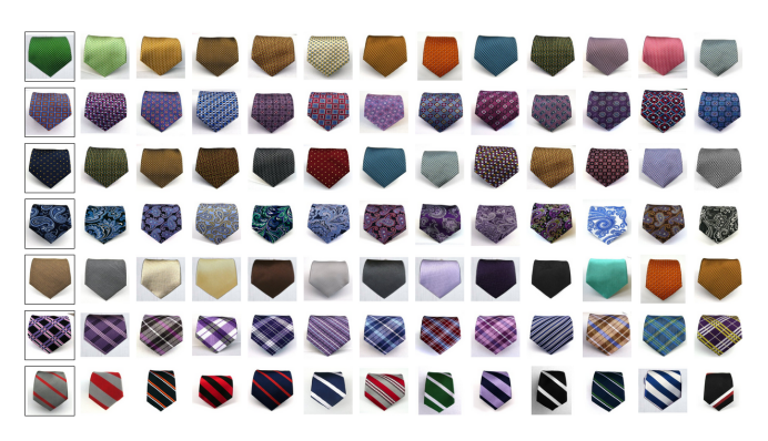
Figure 4. Nearest-neighbors for some neckties from the tiestore dataset. Nearest neighbors are displayed from left to right. Note that neck ties were never confused for bow ties, tie clips or scarves.