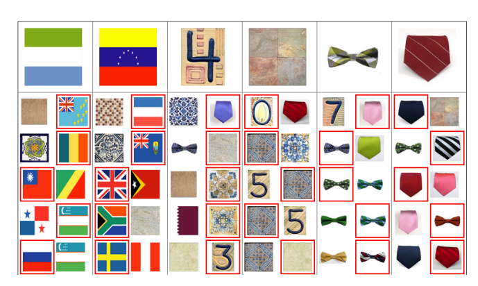
Figure 3. Six objects in the mixed dataset along with the adaptive pairs to which that object was compared, below, and user selections in red. The first pair below each large object was chosen adaptively based upon the results of ten random comparisons. Then, proceeding down, the pairs were chosen using the ten random comparisons plus the results of the earlier comparisons above.