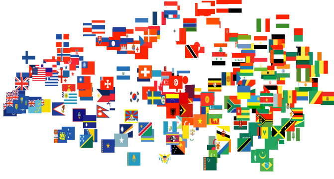
Figure 6. The flag images displayed according to their projection on the top two principal components of a PCA. The principal component is the horizontal axis.